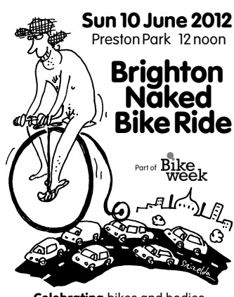
Celebrating bikes and bodies Demonstrating cyclists' vulnerability Protesting against car culture