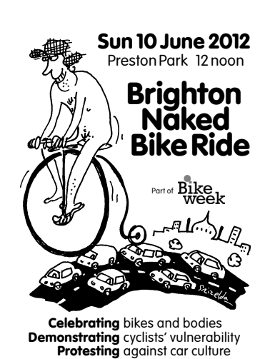
Demonstrating cyclists' vulnerability Protesting against car culture worldnakedbikeride.org/brighton