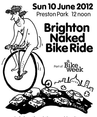
Celebrating bikes and bodies Demonstrating cyclists' vulnerability Protesting against car culture worldnakedbikeride.org/brighton