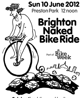
Celebrating bikes and bodies Demonstrating cyclists' vulnerability Protesting against car culture worldnakedbikeride.org/brighton

brighton@worldnakedbikeride.org 07944 152706 / 07812 036415