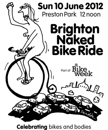
Demonstrating cyclists' vulnerability Protesting against car culture worldnakedbikeride.org/brighton